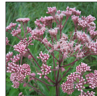
Spotted Joe Pye weed